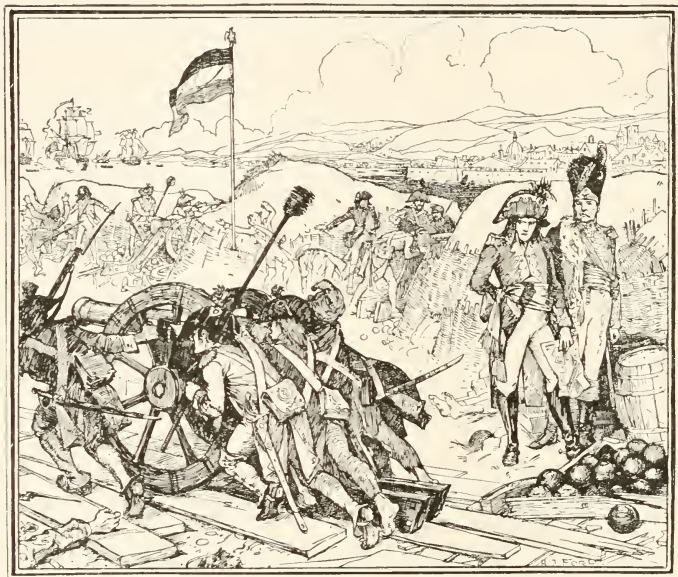
BONAPARTE IN THE BATTERY OF THE FEARLESS

must be the first object of attack. Close underneath the fort a French battery was erected and manned — only to be swept clear by the guns from the English ships. Another set of volunteers slipped out from the ranks, and fell dead beside their comrades. For the third time Bonaparte gave the word of command, but there